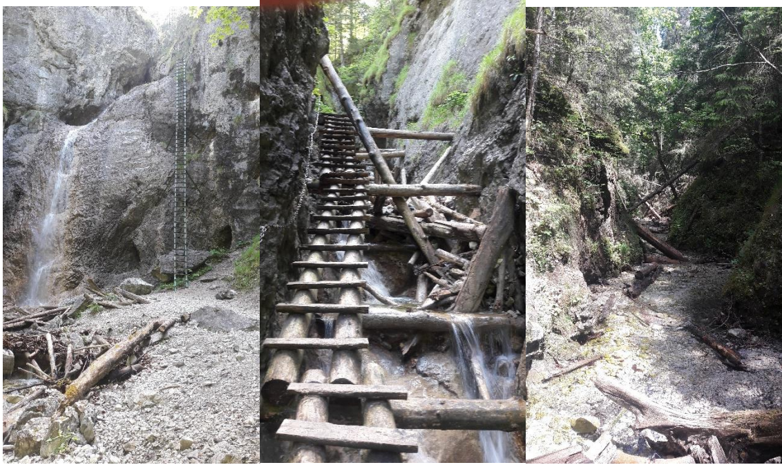
Hiking in the Slovensky Raj