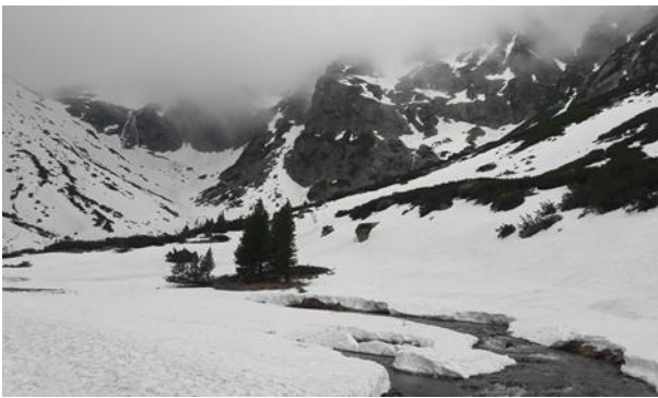
Hiking in the High Tatras (around 1700m AMSL)