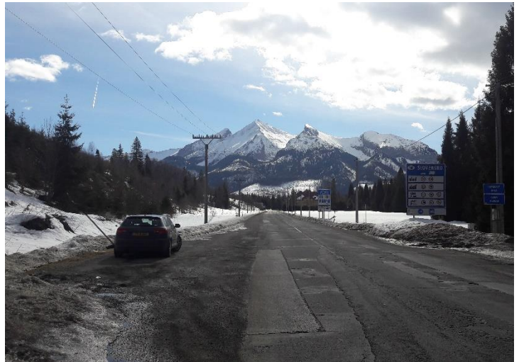
Border from Poland to Slovakia