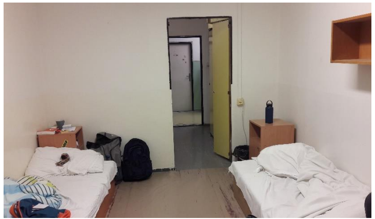
Mei Hostel dorm