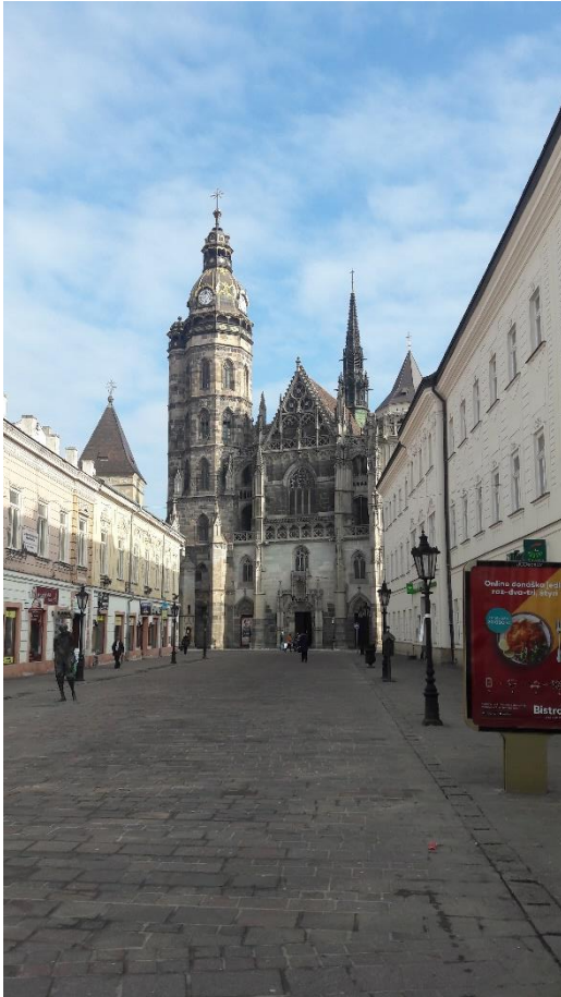
Cathedral, view from Ul. Alzbetina, Košice