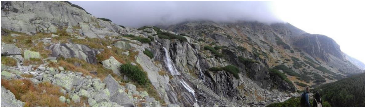
Vodopád Skok (SK)