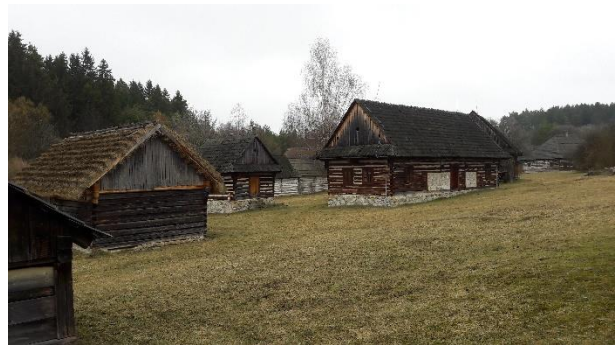
Open-air village museum, next to Martin