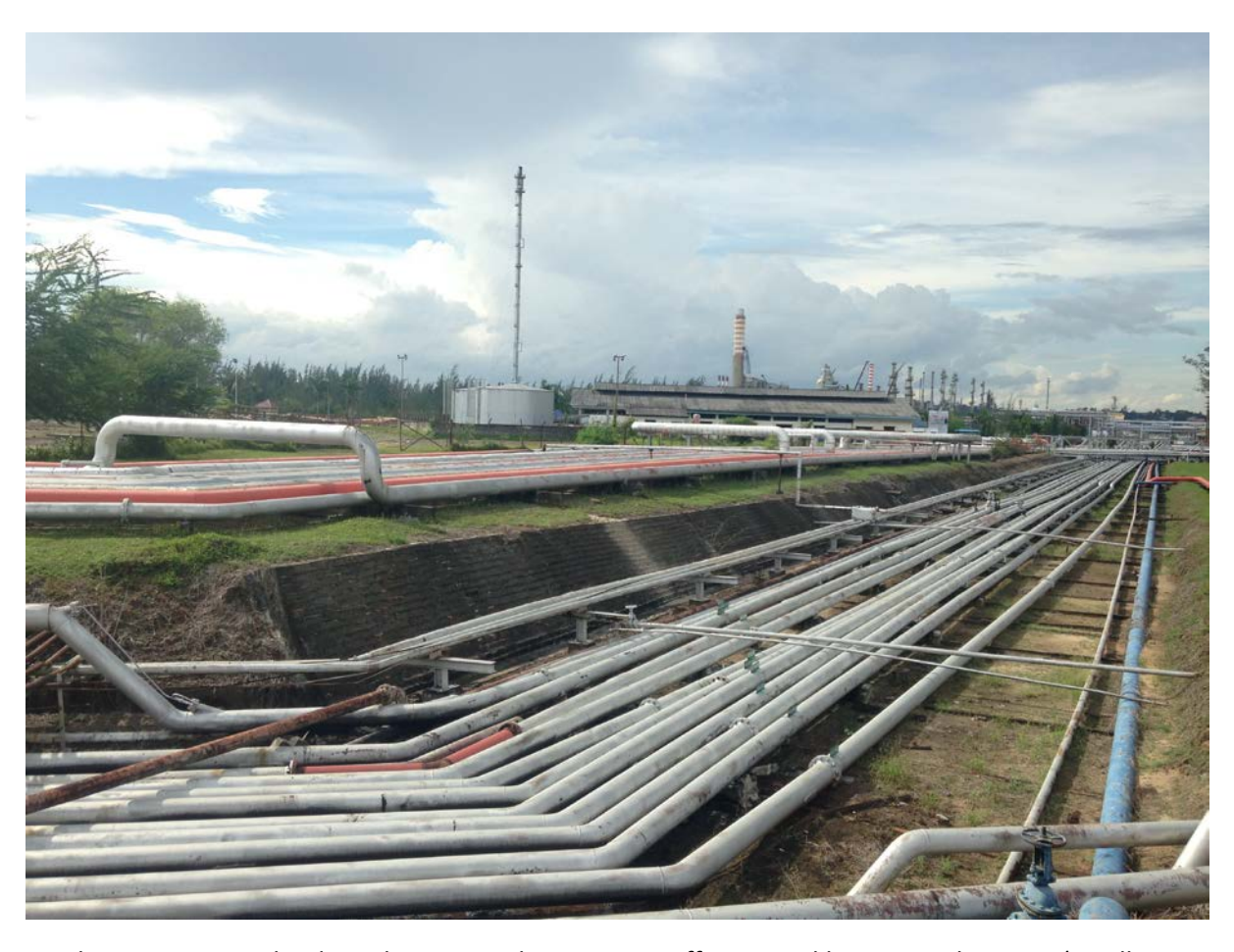
Pipeline-Netz zur Verbindung der Terminals mit einer Raffinerie, Balikpapan, Indonesien