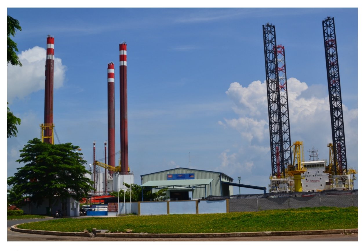
Offshore-Plattformen in Wartung, Vung Tau, Vietnam