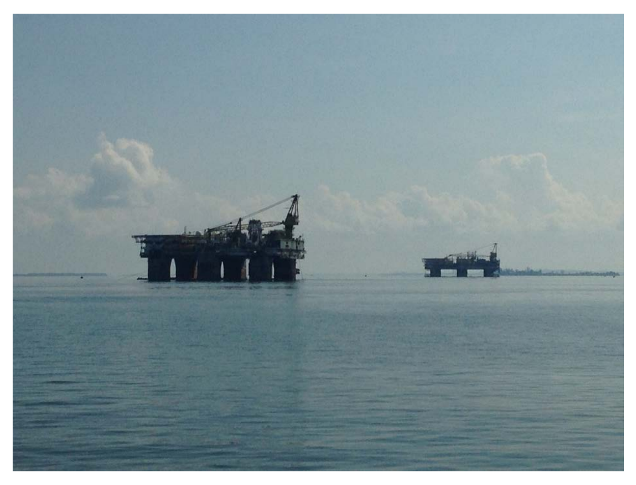
Offshore-Plattformen bei Pulau Bintan, Indonesien